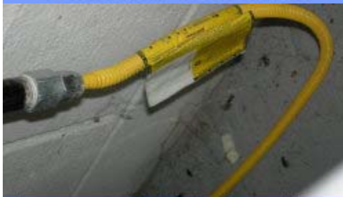
Approved Flex Gas Line