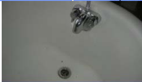
Tub Spigot Below Rim