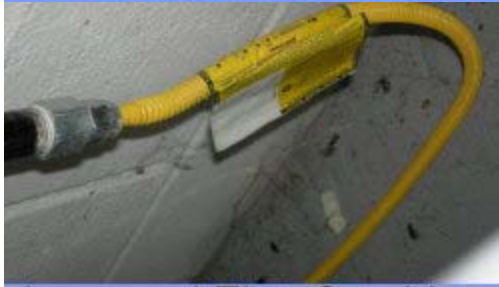
Approved Flex Gas Line